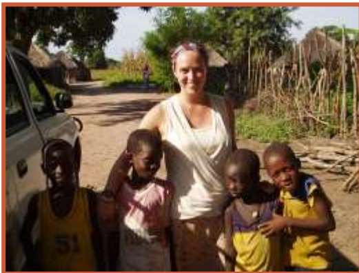
French Language Ideology: Perspectives from a National, Global, and Local level