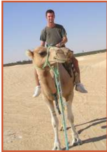
The Clash of Two Worlds: A Study of North African Immigration Into France