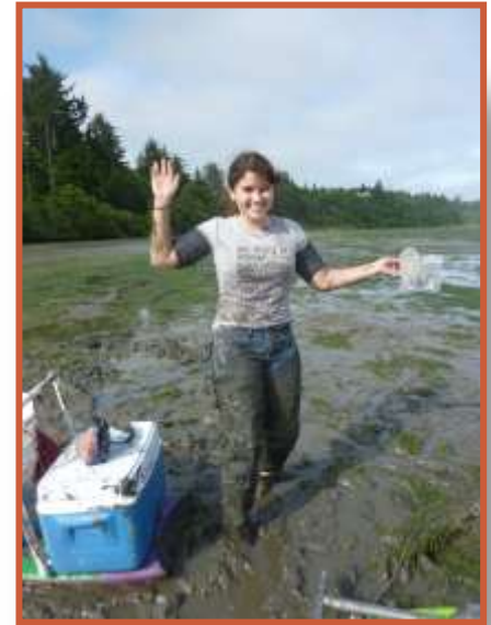
Under the Sea: An Evaluation of the Establishment and Continued Effectiveness of the Galapagos National Park and Marine Reserve in Ecuador